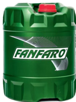
20L FF4307-20 208L FF4307-DR