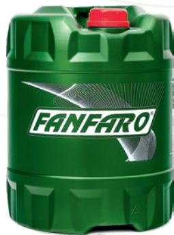
20L FF4306-20 208L FF4306-DR 1000L FF4306-IBC