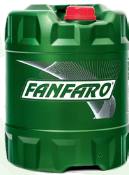
20L FF4305-20 208L FF4305-DR